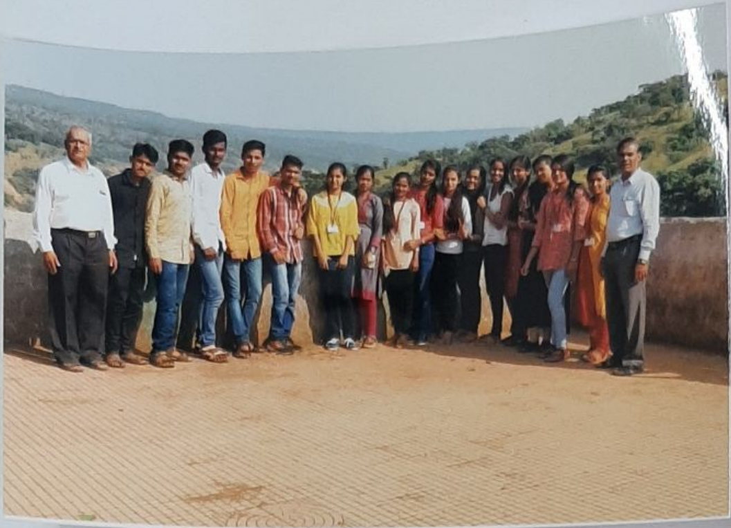
At Thoseghar Waterfall