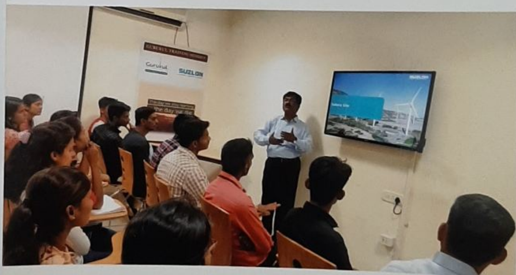
Guidance of Manager about Working of Turbine