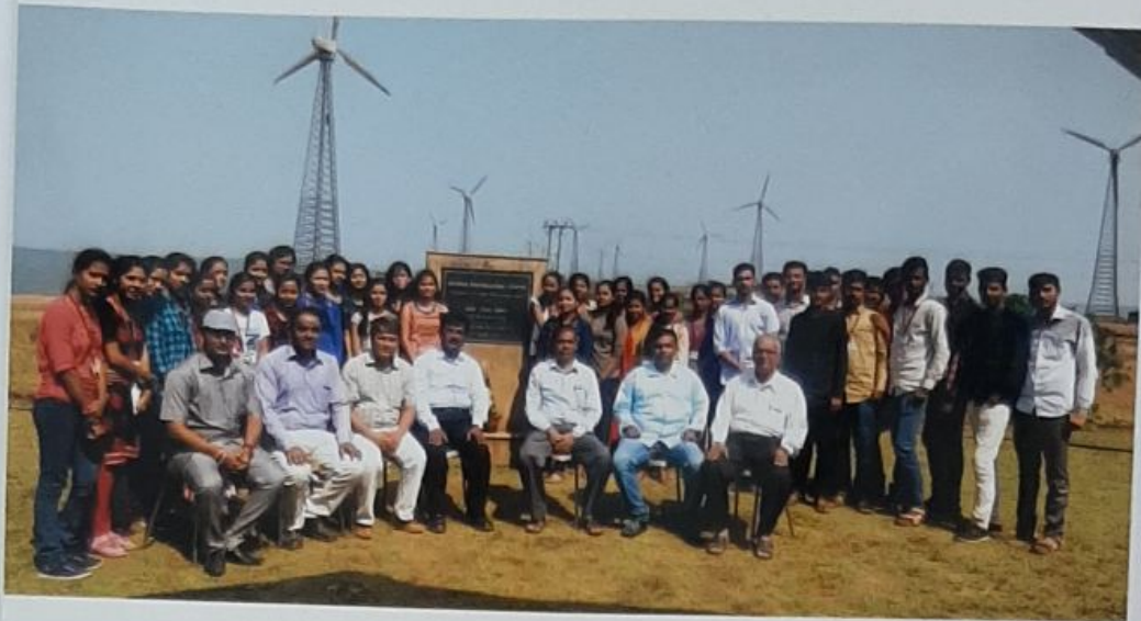
With Manager, Suzlon Wind Mill, Chalkewadi